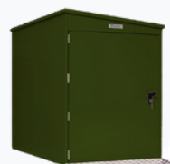
Fir Green SFSM001-318