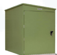
Lakeland Green SFSM001-319