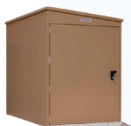
Clay Brown SFSM001-317