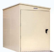
Ivory / Cream SFSM001-316