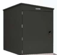
Dark Grey SFSM001-315