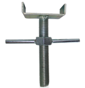
PRODUCT CODE IS-SEA001-A

Designed only to fit the Static Caravan Primary Chassis Support. Available as standard size 110mm & an extra-wide variant 160mm.