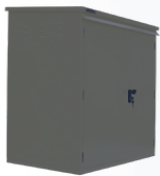
Dark Grey SFSC003-315