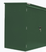
Fir Green SFSC003-318