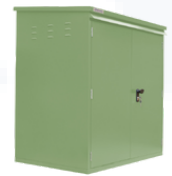
Lakeland Green SFSC003-319