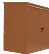
Clay Brown SFSC003-317