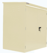
Ivory / Cream SFSC003-316